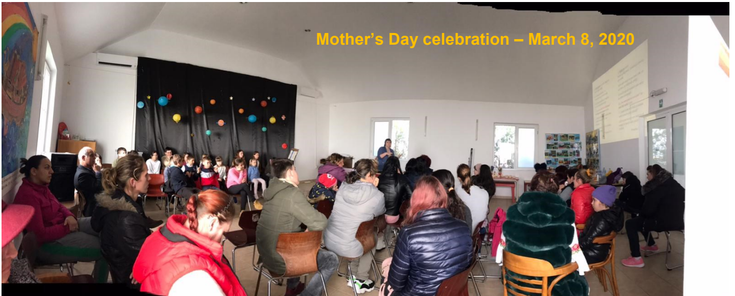
Mother's Day celebration – March 8, 2020

We remember the Mother's Day celebration – March 8, 2020, when the children and their mothers came to the Sunlight Centre, where we celebrated this day. 24 mothers with children attended. We rejoiced in speaking to these mothers about God again.